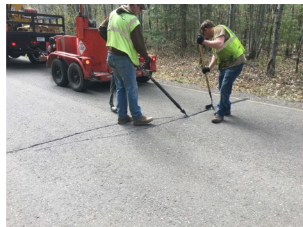
Crack patching on Jarvinen Road

Work continues with the rebuild of Watkins Spur. The town board hosted a public hearing with a preliminary design in January 2020. On May 18, 2020, Carlton County Transportation and the Perch Lake