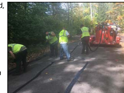
Crack sealing on Lyndhurst Bay Drive

New home construction also occurs in the summer. Perch Lake Township requires a driveway permit for access to town roads. A